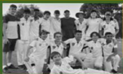
U14's Champions 22/23